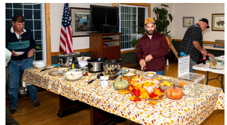
The food table was a hit with guests

So, mark your calendars for October 17, 2026 and get ready for another fun evening at Township Hall.